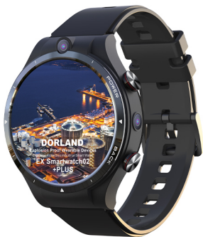
Watch® EX02 Plus 4G Full Frequency